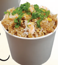
ST FRIED RICE