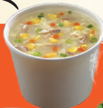
CRAB & CORN SOUP