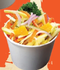
GREEN MANGO SALAD