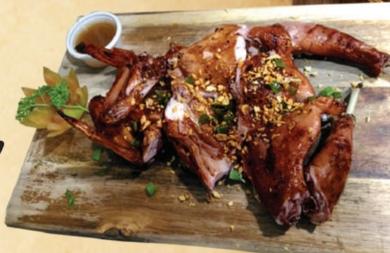
NATIVE GRILLED CHICKEN