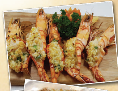
Surf & Turf Boiled Crabs