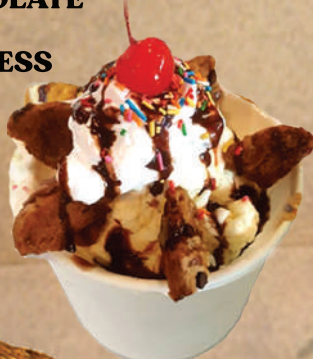
CHOCOLATE CHIP MADNESS